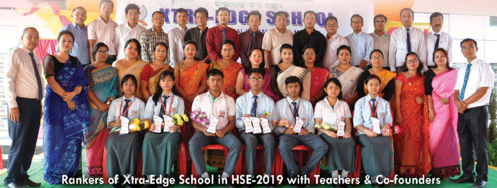
Rankers of Xtra-Edge School in HSE-2019 with Teachers & Co-founders