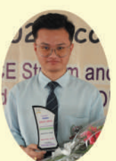
MUTUM MIR HPE-100/100