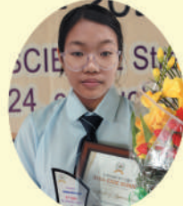
CHANREIDAR TONTANGA HPE-100/100