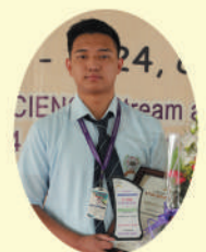
MOSHANGCHARM NARHANG HPE-100/100