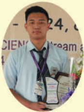
MOSHANGCHARM NARHANG 16 th Position Science