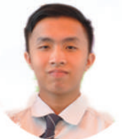
ANGANBA NINGTHOUJAM COM SCIENCE 100/100