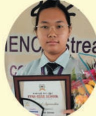
GEETASANA SORAM HPE-100/100