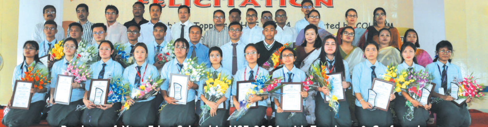
Rankers of Xtra-Edge School in HSE-2019 with Teachers & Co-founders